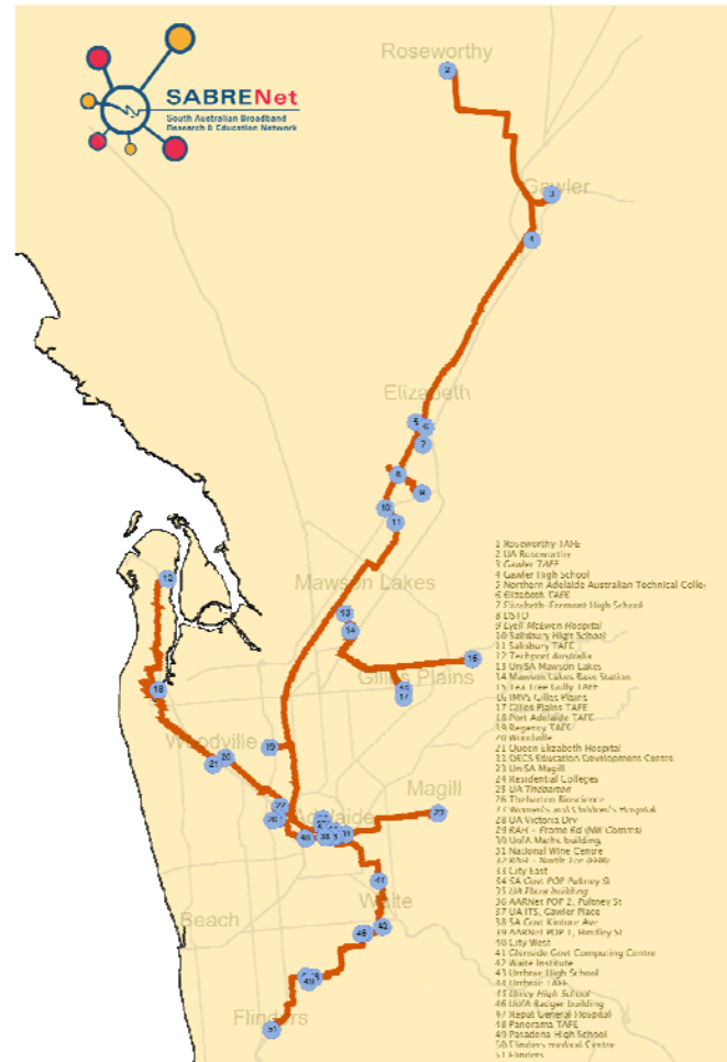
Figure 1 - SABRENet route map

SABRENet provides optical fibre connections to 67 R&E sites in the greater Adelaide metropolitan area (see Appendix A ) at data speeds in excess of 1 gigabit per second.