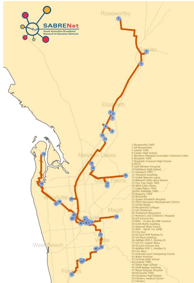
Figure 1 - SABRENet route map

SABRENet provides optical fibre connections to 75 R&E sites in the greater Adelaide metropolitan area (see Appendix A ) at data speeds in excess of 1 gigabit per second.